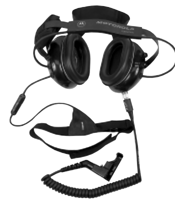
BDN6636B (Shown with adapter cable BDN6638A)