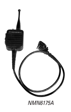
* Intrinsically safe

*NMN6175A Public Safety Remote Speaker Microphone, with Clip Back, 800-900 MHz Antenna Included