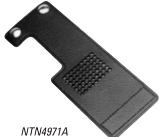
Full Cover NTN4971A Full Cover, Velcro, for all models