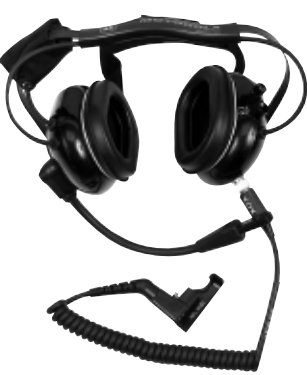
BDN6635B (Shown with adapter cable BDN6638A)

BDN6635B Voice-Activated Headset with Boom Microphone; Requires Adapter Cable BDN6638A; includes 110V Charger