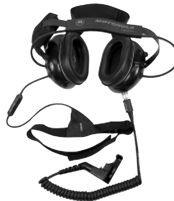
BDN6636B (Shown with adapter cable BDN6638A)

BDN6636B Voice-Activated Headset with Throat Microphone; Requires Adapter Cable BDN6638A; Includes 110V Charger