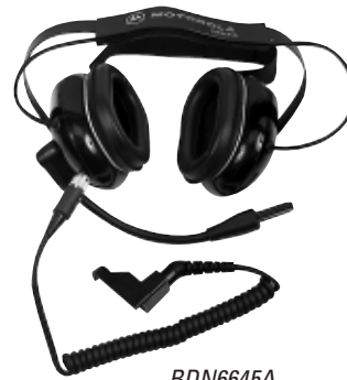
BDN6645A (Shown with adapter cable BDN6638A)

BDN6645A Push-To-Talk Headset with Boom Microphone; Requires Adapter Cable BDN6638A