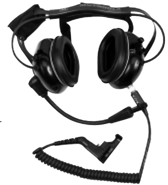
BDN6635B (Shown with adapter cable BDN6638A)

BDN6635B Voice-Activated Headset with Boom Microphone; Requires Adapter Cable BDN6638A; includes 110V Charger