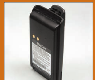
Mag One 1200mAh NiMH Battery PMNN4071_R