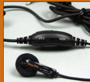
Mag One Earbud with In-line Microphone and PTT/VOX Switch PMLN4442