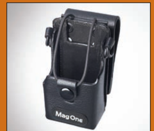
Mag One Hard Leather Case PMLN4742