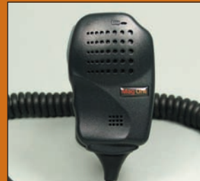
Mag One Remote Speaker Microphone PMMN4008

The following Mag One accessories have been tested with the BPR 40 to ensure maximum performance.