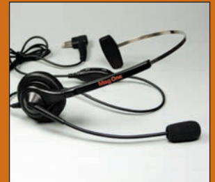
Mag One Ultra Lightweight Headset with In-line PTT/VOX Switch PMLN4445