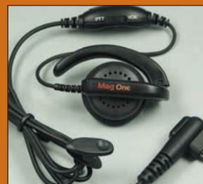
Mag One Ear Receiver with In-line Microphone and PTT/VOX Switch PMLN4443_B